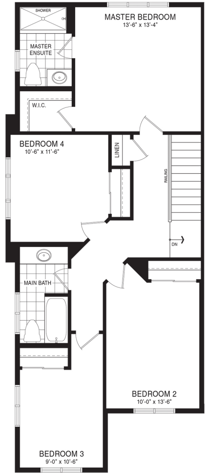
SECOND FLOOR PLAN STYLE A